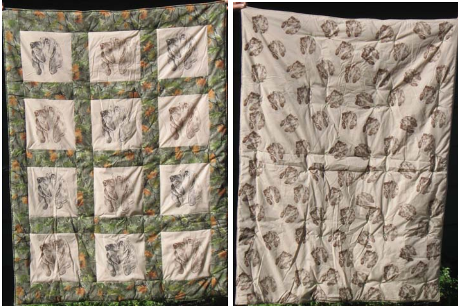
Beautiful hand-made, hand-stamped bloodhound quilt. $1.00/ticket. $10.00/15 tickets